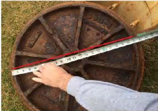
C: Drop Ring Diameter is measurement of red line.