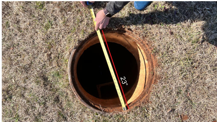
(A) Manhole Frame Diameter (flat bearing surface that manhole lid sits on.)

*Measurements indicated above may be different at each location*