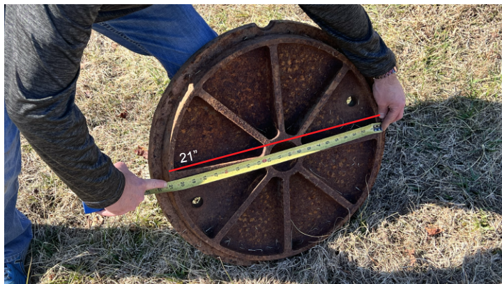
(C) Drop Ring Diameter (Bottom of manhole support ring)

*Measurements indicated above may be different at each location*