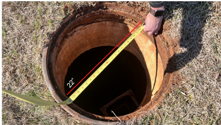
(B) Inside Frame Diameter (Through hole)

*Measurements indicated above may be different at each location*